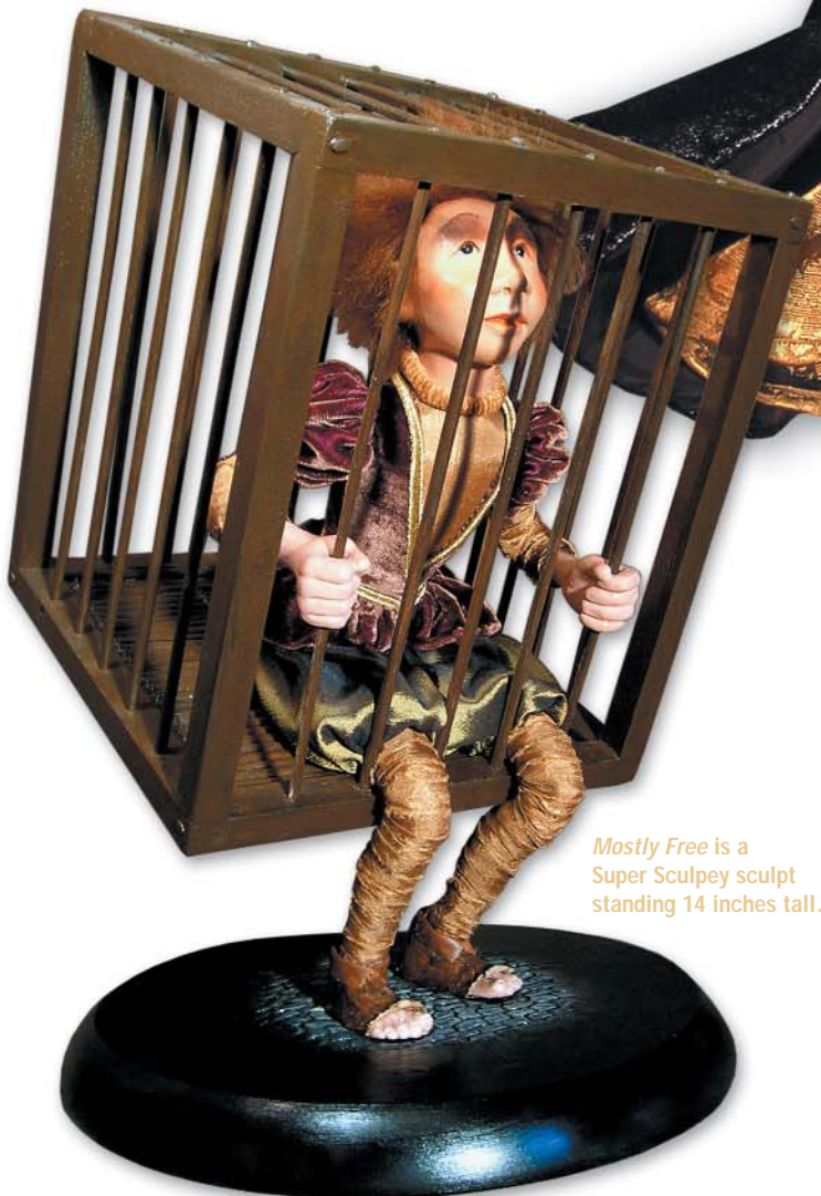
Mostly Free is a Super Sculpey sculpt standing 14 inches tall.