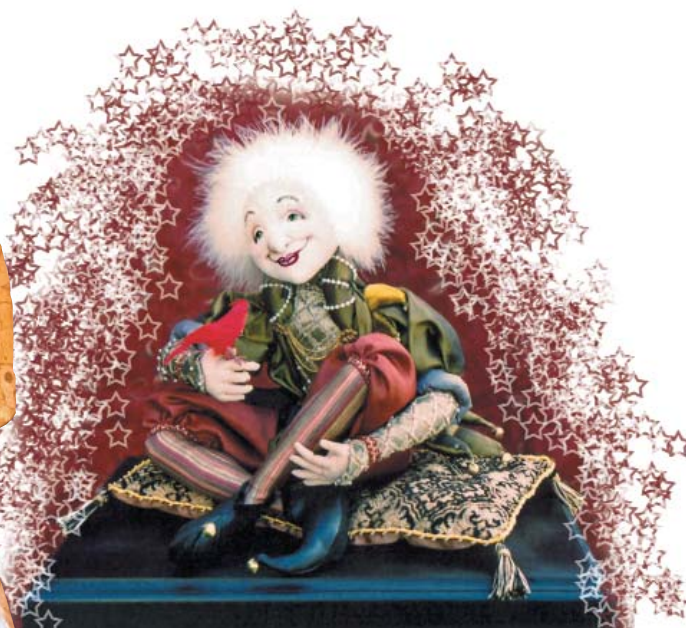
Elf with a Bird, is one of Cristina's earlier cloth dolls. The piece is 14 inches tall.

that usually take many months of planning and fabrication."